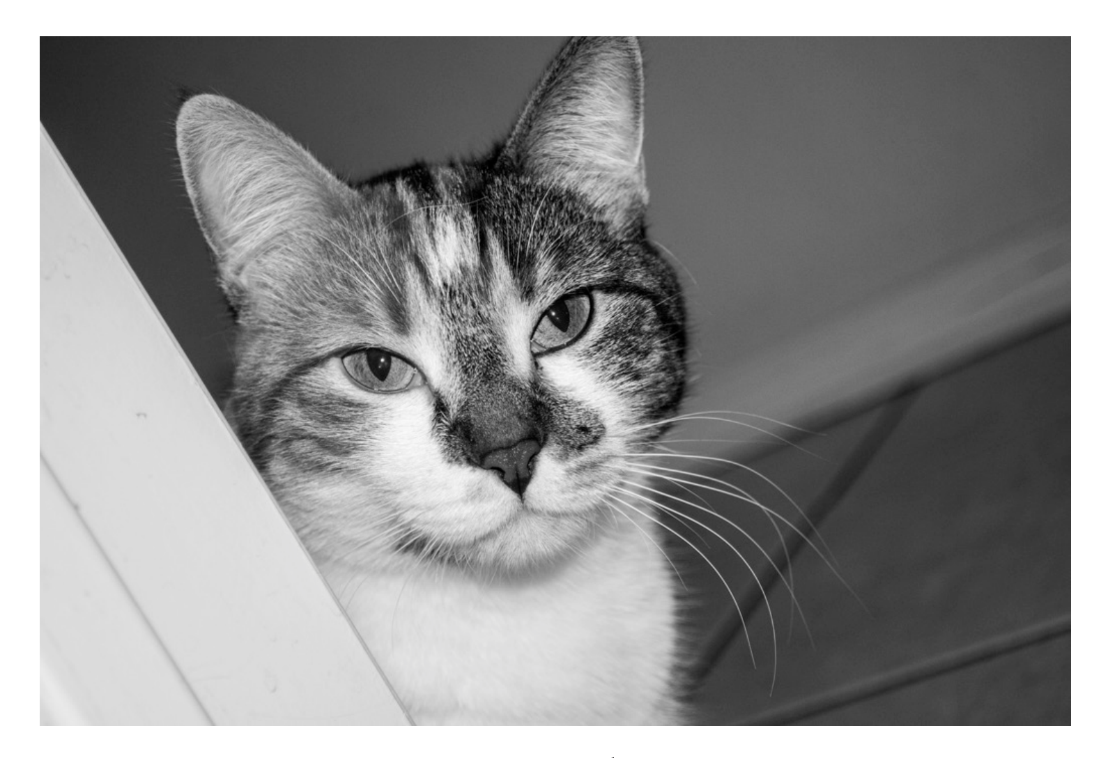
Gucci: A Kitty Who Lives on South Congress