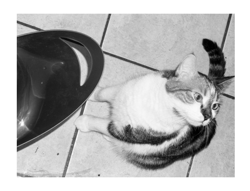
You found a trashcan, kitty.