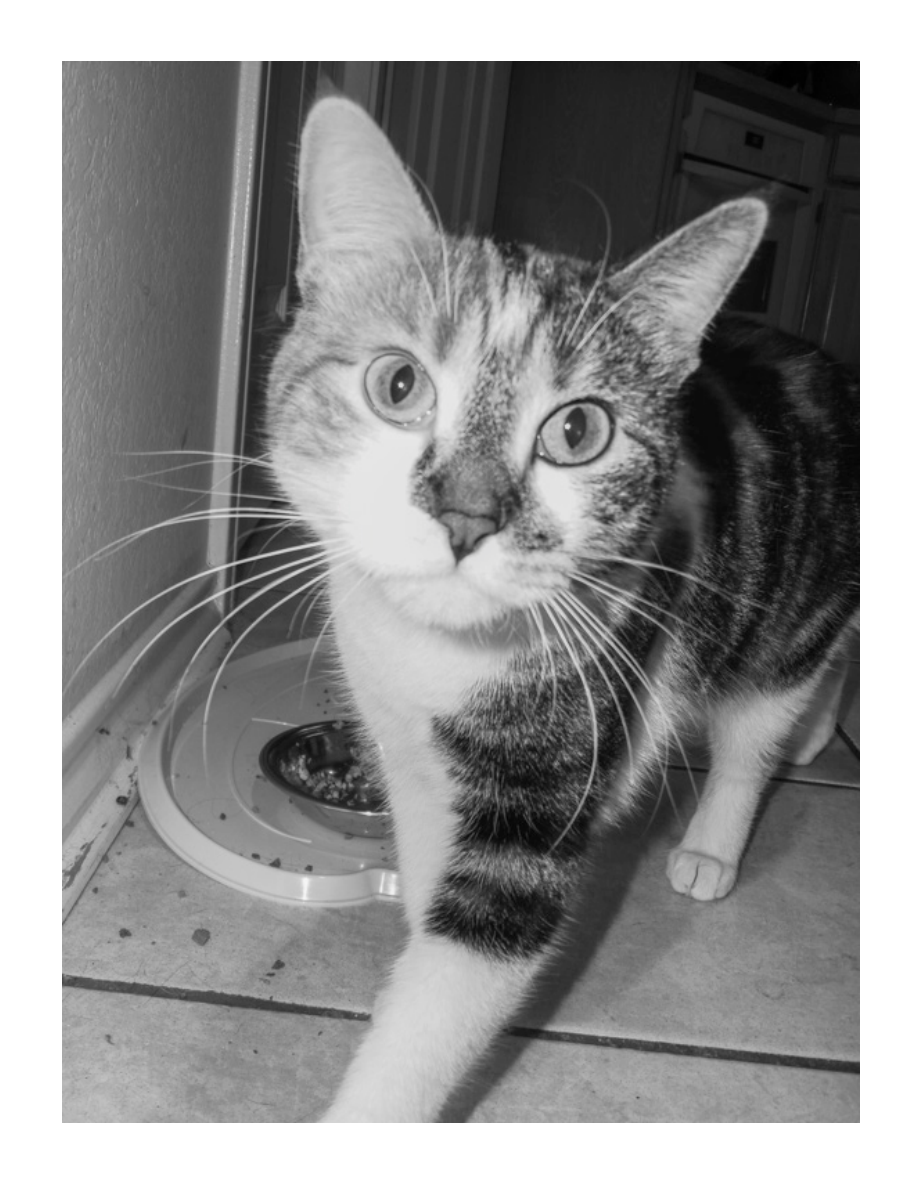
Where to next, kitty?