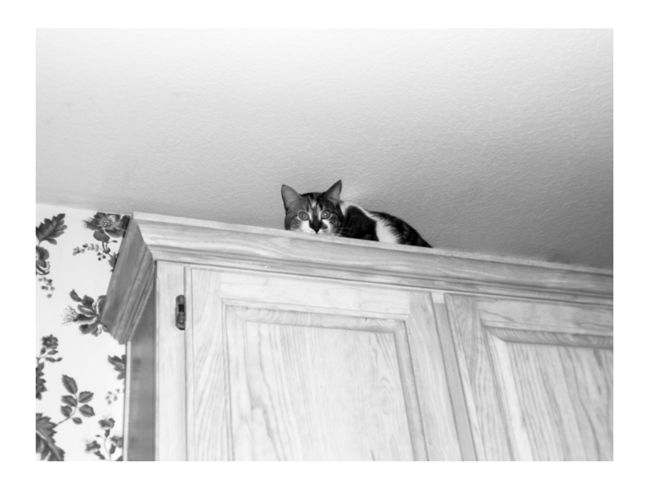
Too far away, kitty!