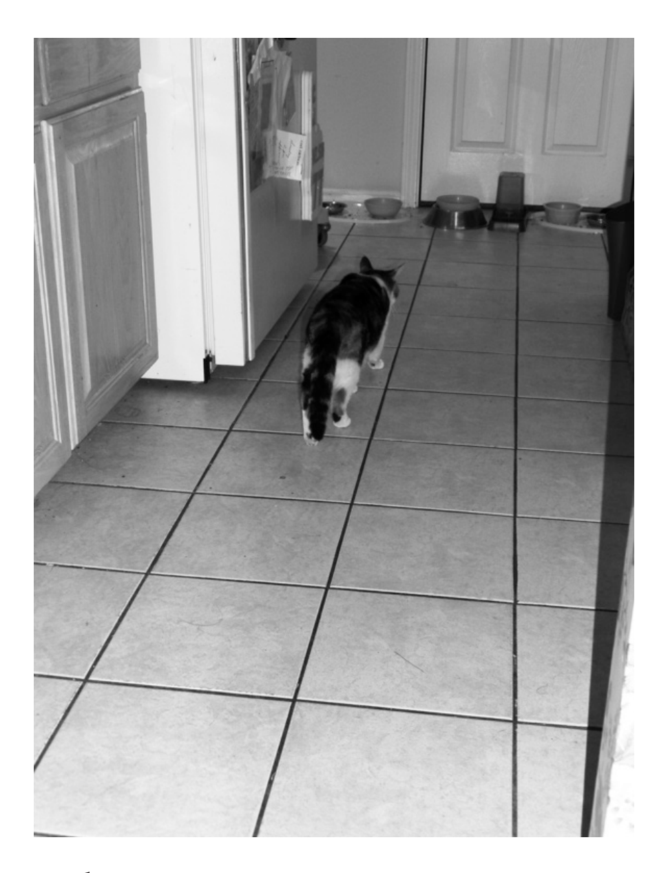
Where are you going, Kitty?