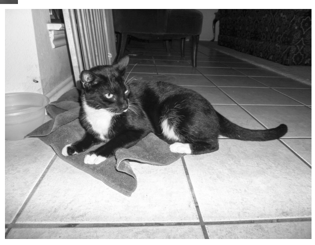
Bye other kitty!